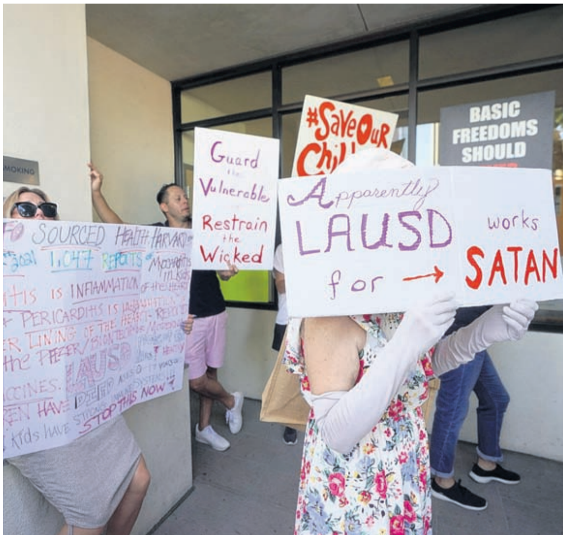
Anti-vaccine mandate protesters hold signs outside the front doors of the Los Angeles Unified School District, LAUSD headquarters in Los Angeles, on Sept. 9, 2021.

The researchers found suggestions that far-right groups on Telegram are working together. ISD researchers linked two usernames involved in running one Telegram channel to two prominent members of the American far-right. One was a scheduled speaker at the 2017 Unite the Right rally in Charlotte,